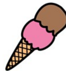
ice cream cone